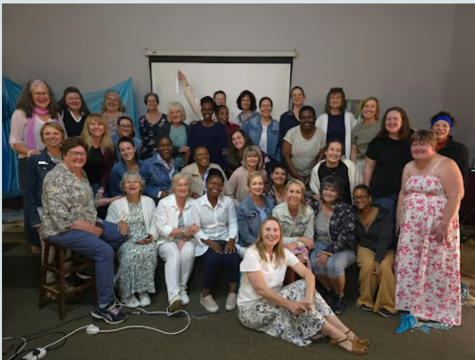
The women who attended the camp

able to receive, respond and experience refreshment, freedom and peace – some have not known these realities for some time, and it was beautiful to witness the change in expression from the coming in on Friday afternoon to the departure on Sunday. We give God all the glory! He is worthy of our complete and uttermost praise! Thank you, Lord, for every breakthrough, every revelation, every act of love, every touch and for your unmatched presence. 1 Cor 3:6-7: "I planted, Apollos watered, but God gave the growth. So, then, neither the one who plants nor the one who waters is anything, but only God who gives the growth."