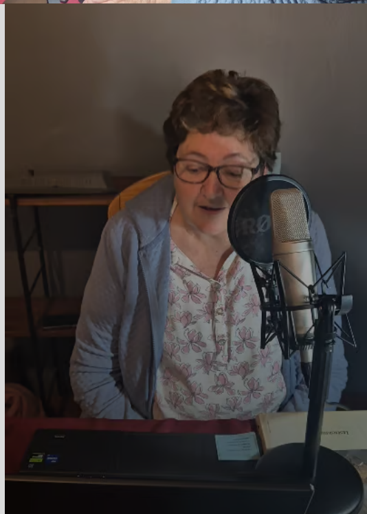
First test recordings